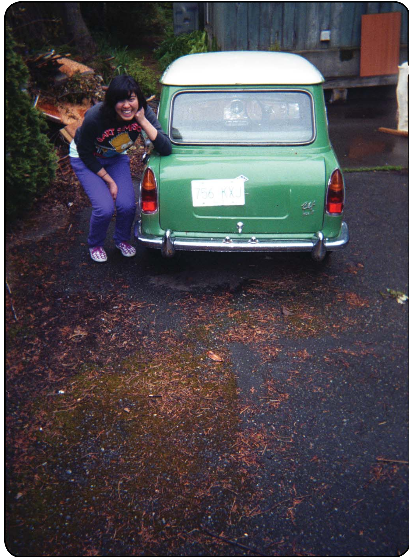
someone's house someone's car