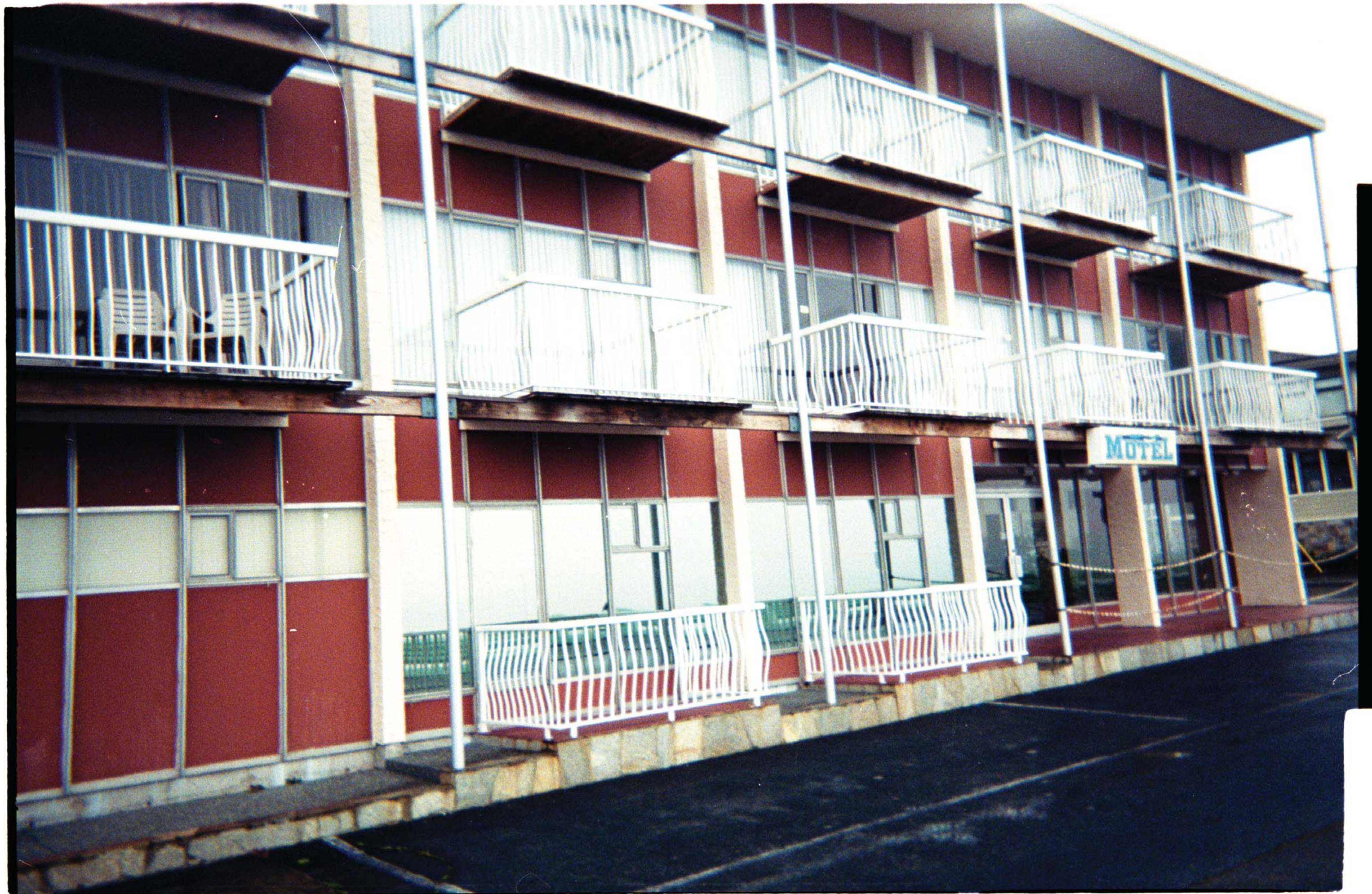
● seaside motel, is it shut down?