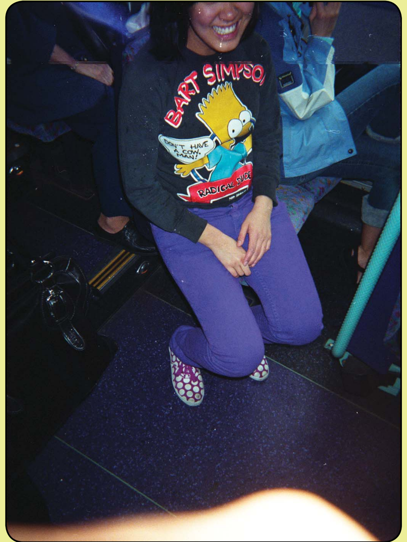
on the bus