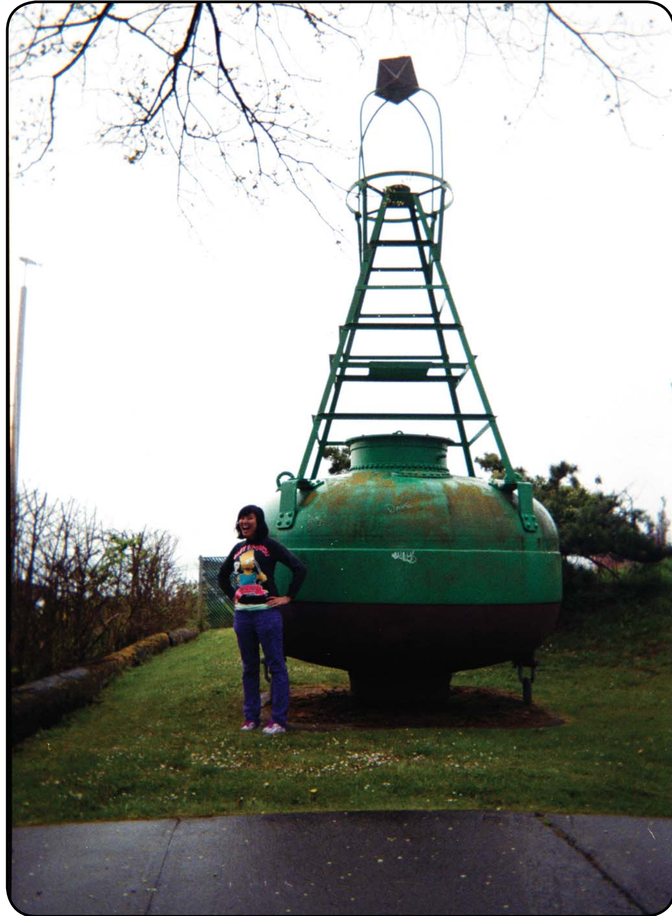
standing with a buoy