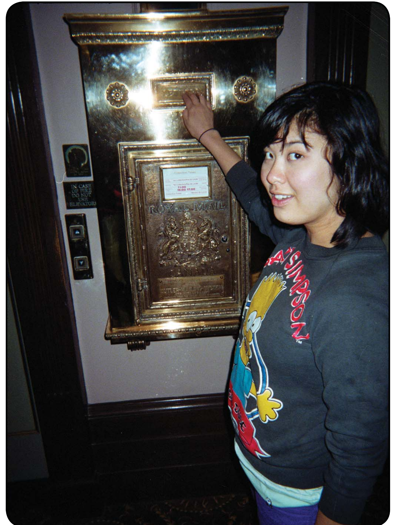
the empress' royal mailbox