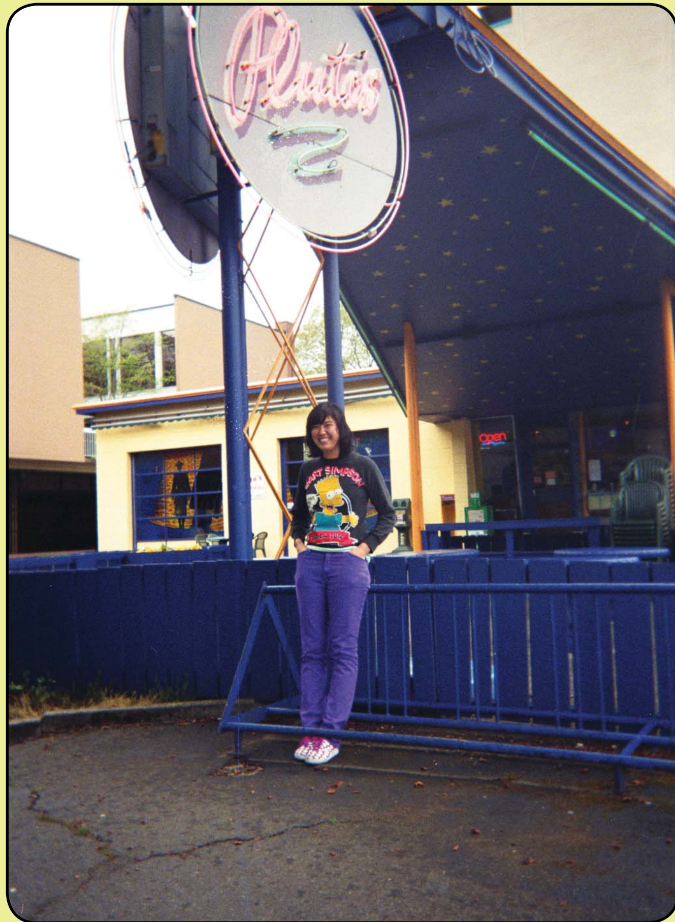
outside of pluto's